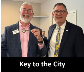
Key to the City