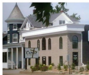
Located inside "The Center" 1411 Brady St. Davenport IA call: 563-324-2235

The Friendly Thrift Center offers assistance to those in need offering merchandise at affordable, low prices