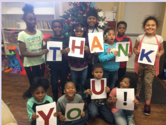
Hope at the Brick House

AIM (ASBURY IN MISSION) .... "DOING GOD'S WILL" Thank you for supporting our 2022 Missions!