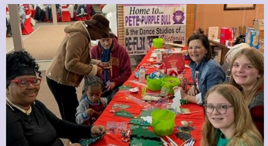
Christmas Dinner at The Center