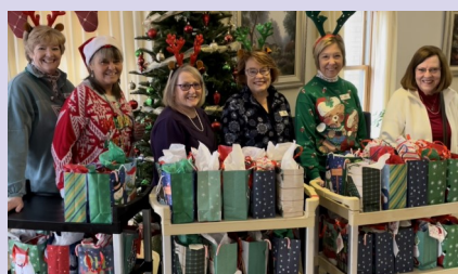
Santa for Seniors at Masonic Home