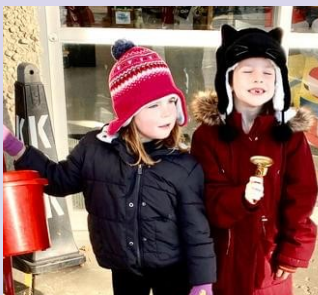
Salvation Army Bell Ringing at K&K