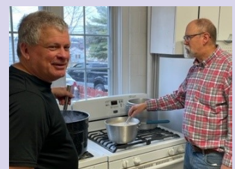
Christmas Dinner at The Center