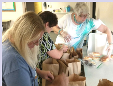
Zion Meal Site