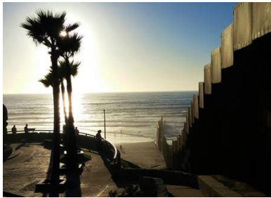
A View from the Other Side

Scan this QR code with your phone for easy access to our website and Facebook page!